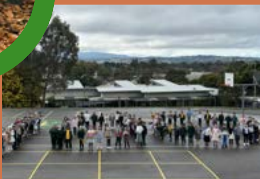
100 DAYS OF FOUNDATION