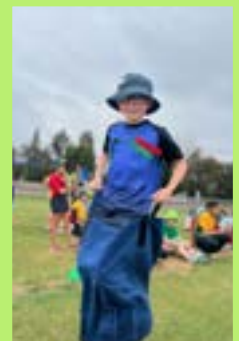
HOUSE COLOUR DAYS