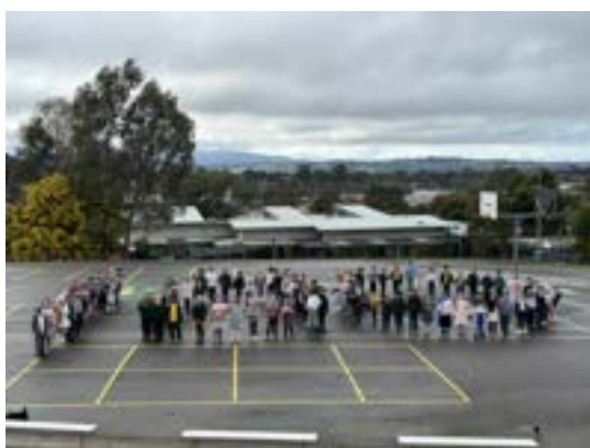
Students made the number 100 on the basketball court.

completing various activities based on the number 100. We also dressed up to mark the occasion!